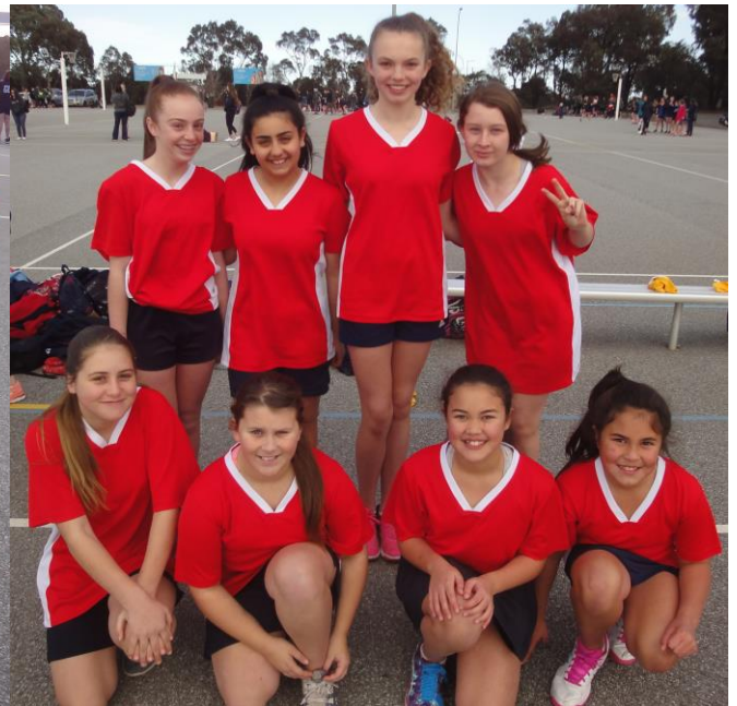
Netball Team 2