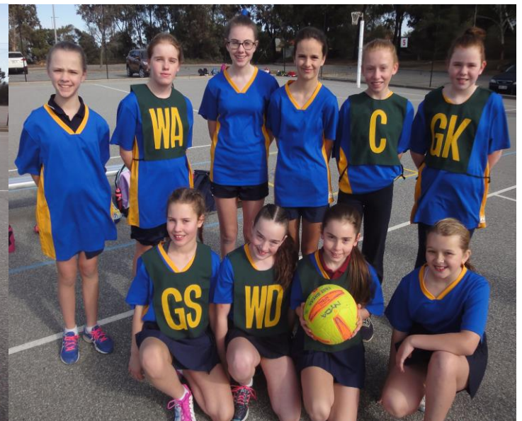
Team 5 - Division H Runners Up