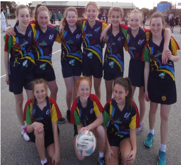
Team 1 - Division A – Champions