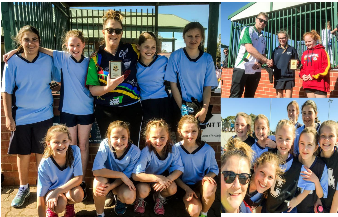
Netball Team 4 – Division E – Champions!!