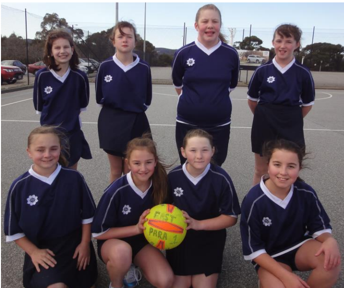
Netball Team 3