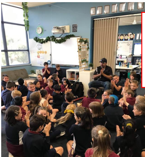
Photos from Trent Hills visit to Rooms 14, 16 and 17 earlier this term.